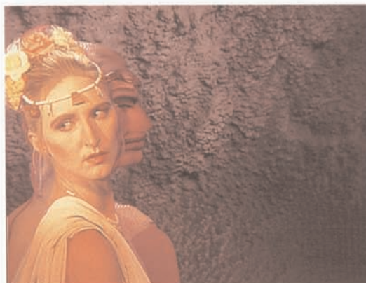
Inanna at the First Gate: Time Trail

created entirely with blue screen, "virtual" sets, and digital post-processing and is exhibited as four life-size, stereoscopic video projections built into a room. The digital processing incorporates unique visualization techniques developed by the artist for this work.