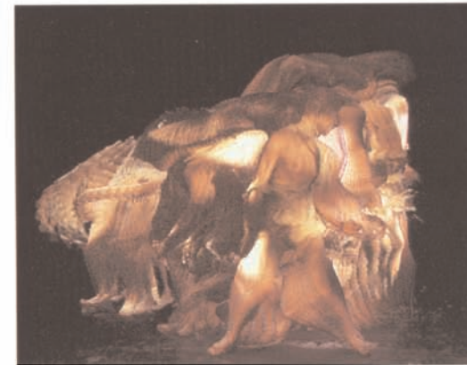
Ereshkigal Waiting: Time Trail